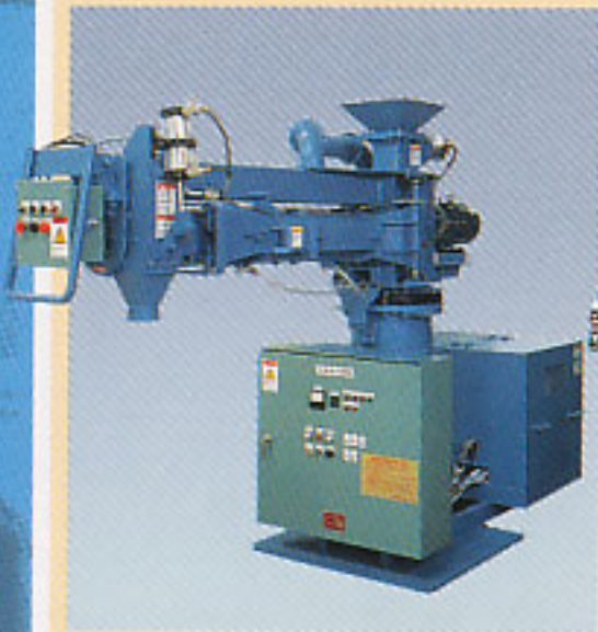
WMS - Continuous Mixer

Mixing trough is fully opened for easy maintenance.