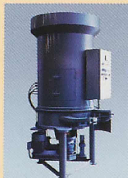
OTM - One-Touch Mixer

● Mixing capacity: 3 types from 3 to 10 tons/hr.