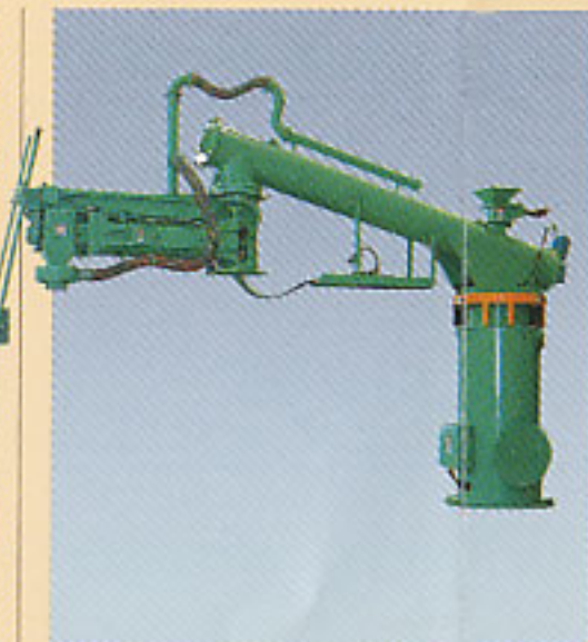
WMW - Continuous Mixer

● Mixing capacity: 4 types from 5 to 30 tons/hr.